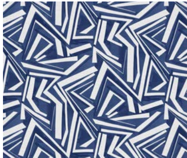
TRANSVERSE | 121053