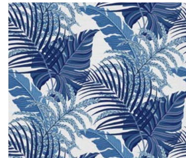
MANILA | 226931