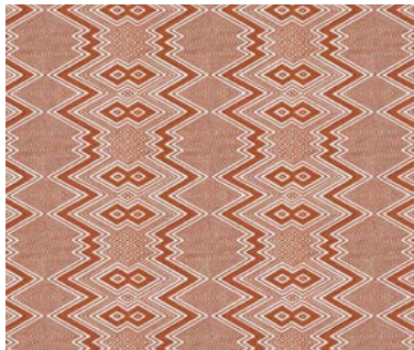
ANKARA | 121059