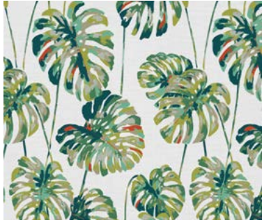
KELAPA | 121047