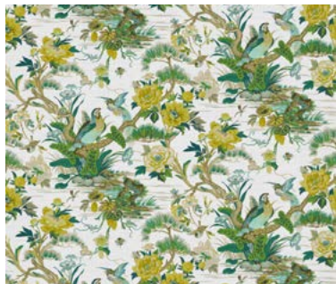
LORIINI | 226928