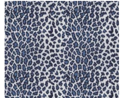
AMUR | 121056