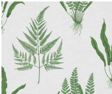
WOODLAND FERNS | 226927