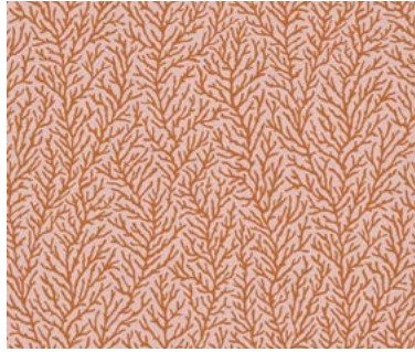
ATOLL | 121048