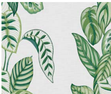
CALATHEA | 226943