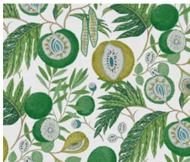
JACK FRUIT | 226935