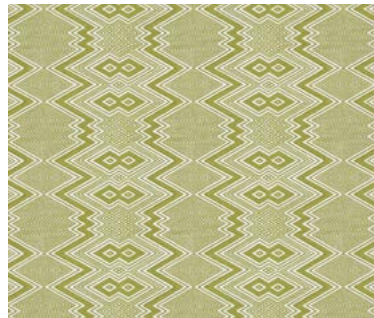
ANKARA | 121060