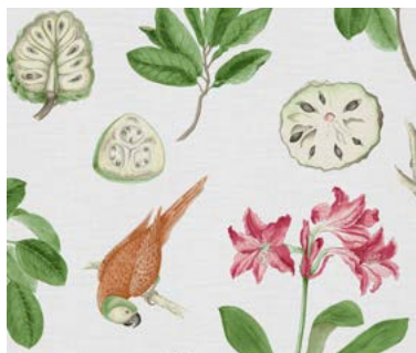
CAPUCHINS | 226944