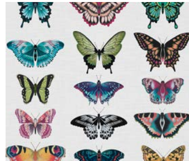
PAPILIO | 121051