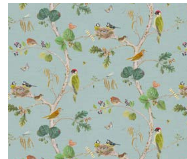
WOODLAND CHORUS 226937