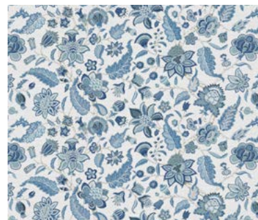
NEWHAM COURTNEY 226936