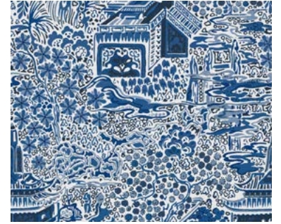
EDO | 121057