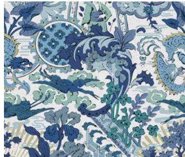
SHENLONG | 121054