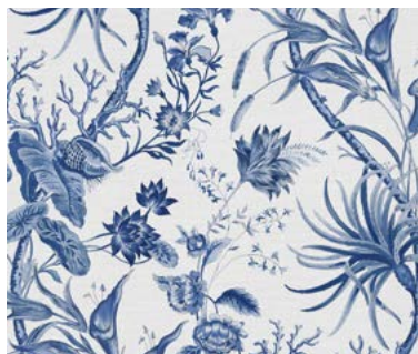
MAURITIUS | 226934