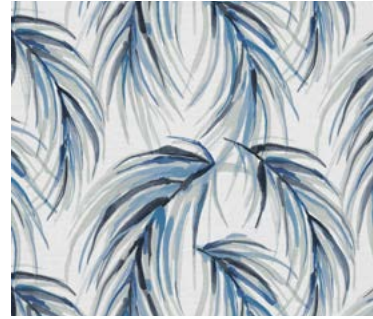
ALVARO | 121050