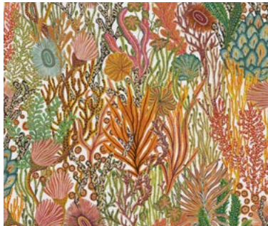
ACROPORA | 121052