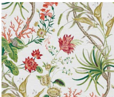
MAURITIUS | 226932