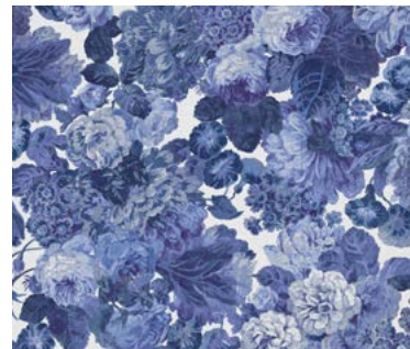
ROSE AND PEONY | 226930