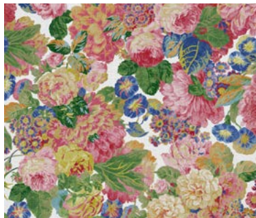
ROSE AND PEONY | 226929