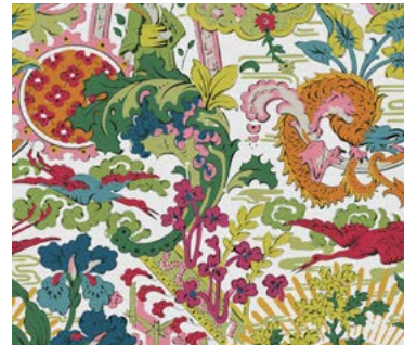
SHENLONG | 121055