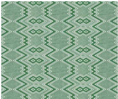
ANKARA | 121058